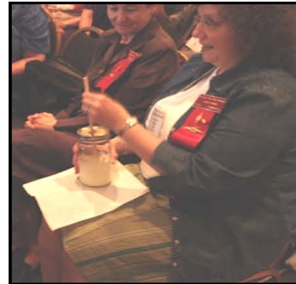
Participants learn to churn butter.